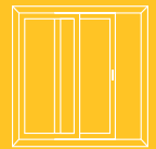
Sliding Patio Door