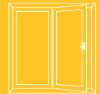
Swing Patio Door