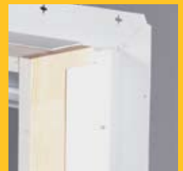
Optional Factory Applied 4 9/16" or 6 9/16" Primed Pine Extension Jamb

Call a Lockheed Window Corp. sales representative to learn more about making your job easier: 800-537-3061