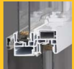
Full Continuous Meeting Rail Interlock With Dual Fin Seal Weather Stripping