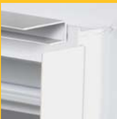
Optional Factory Applied Drywall Return