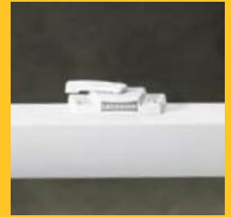
Cam Action Lock

The Nucon® window system with optional Low E Glass meets Energy Star® specifications in all geographical regions, which helps reduce the amount of money spent to heat homes in cold weather and cool homes in warm weather.