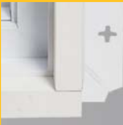
Full 1 3/4" Nail Fin and Optional Integral "J" Channel