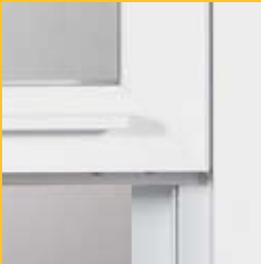
Fingertip Operation with Contoured Lift Rail on Double Hung Model