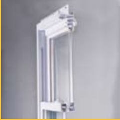
Optional Low E Glass and Standard I-SPACER™ Warm Edge Insulated Glass Spacer

The Nucon® window system provides builders and architects many advantages to other vinyl window manufacturers. A few of our design enhancements are detailed below.